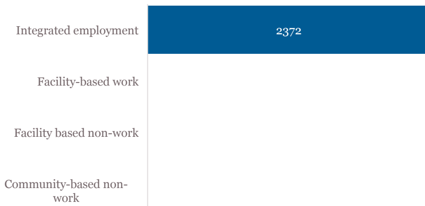
Work and Non-Work Participation (IDD pop., N=20,888)

In a setting that is both inclusive of people with and without disabilities and is in the community