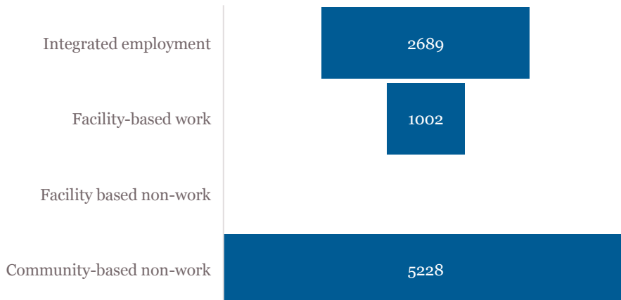
Work and Non-Work Participation (IDD pop., N=8,919)

In a setting that is both inclusive of people with and without disabilities and is in the community