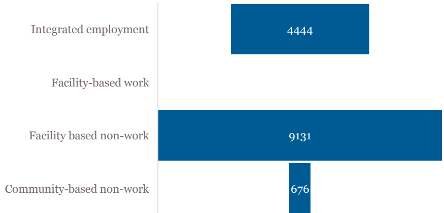
Work and Non-Work Participation (IDD pop., N=13,507)

In a setting that is both inclusive of people with and without disabilities and is in the community